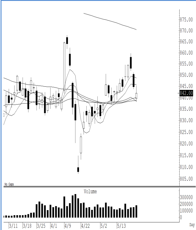
S50M24 (Close 842.00 Chg -2.80)